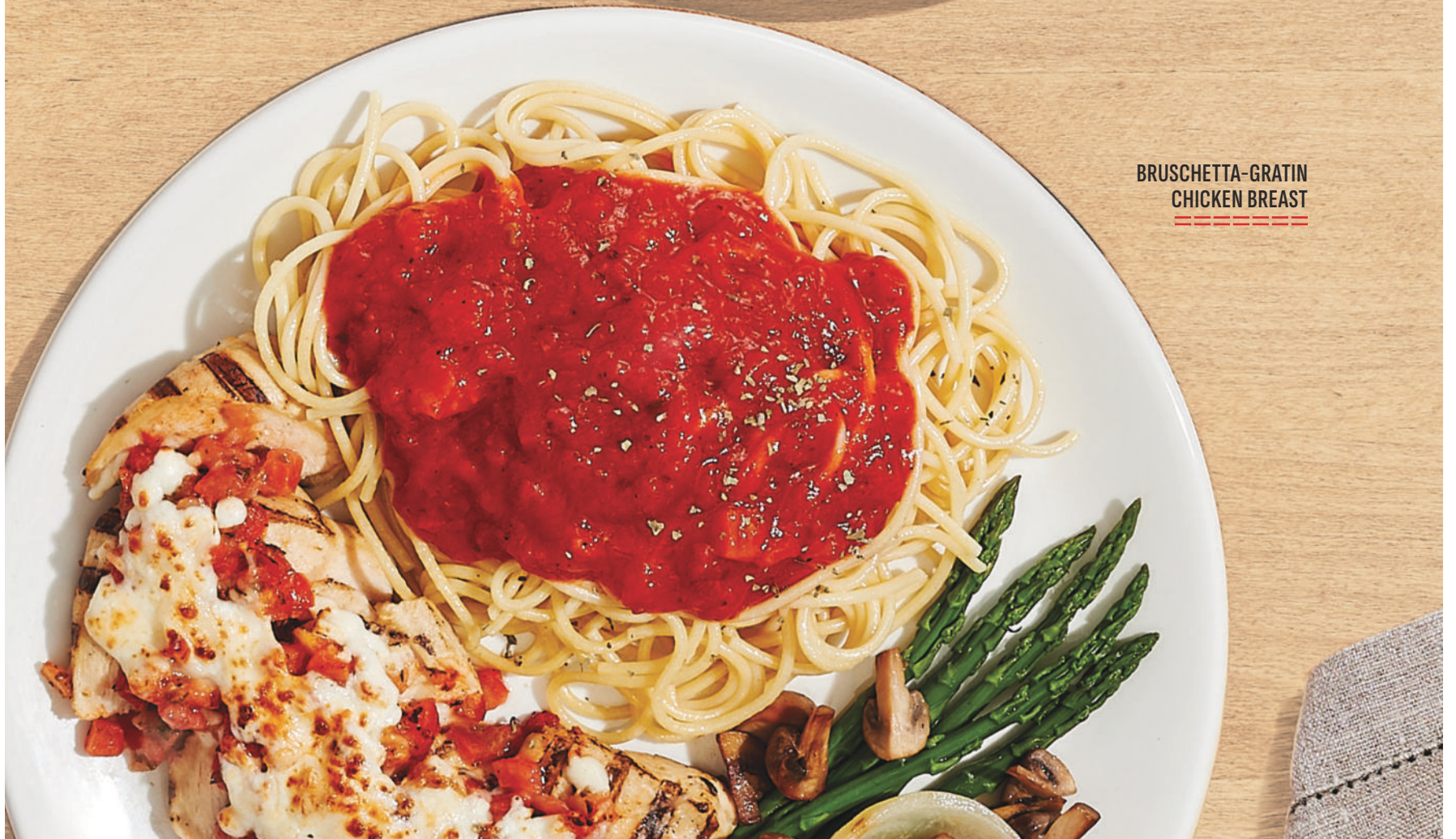
BRUSCHETTA-GRATIN CHICKEN BREAST =====