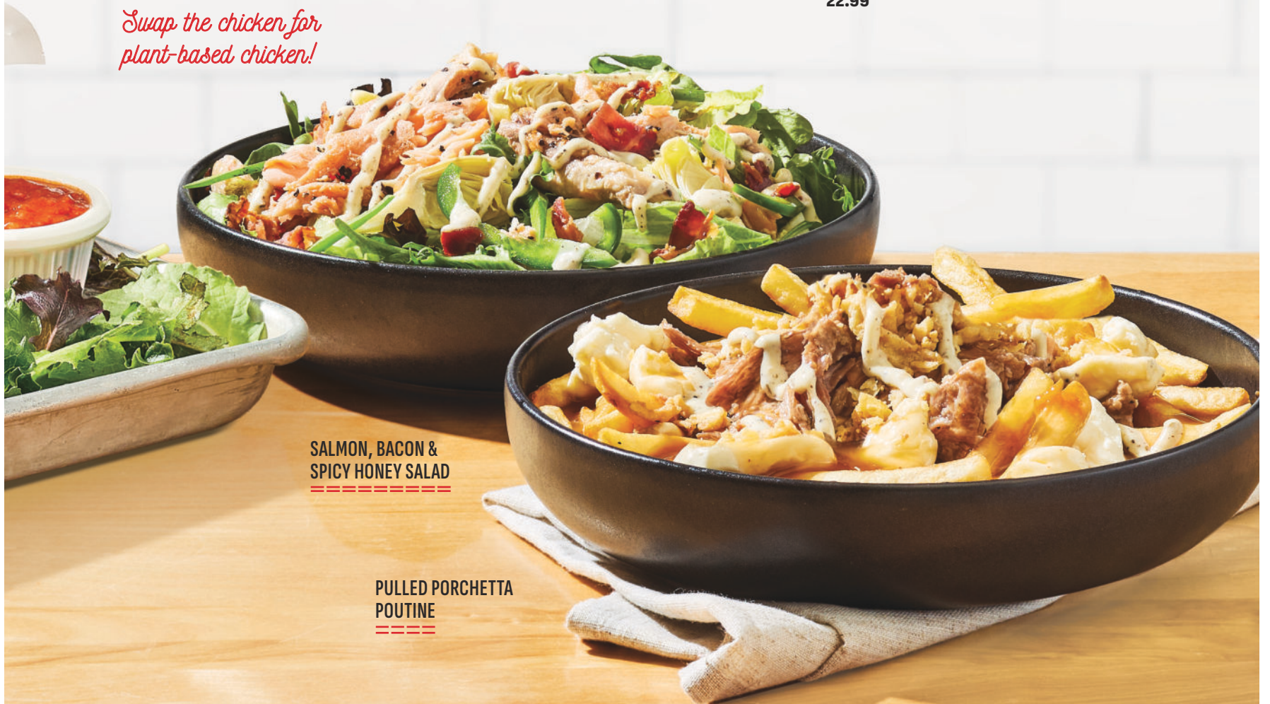
SALMON, BACON & SPICY HONEY SALAD