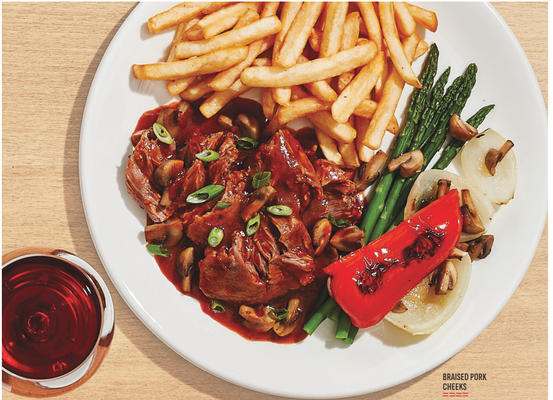
BRAISED PORK CHEEKS =====