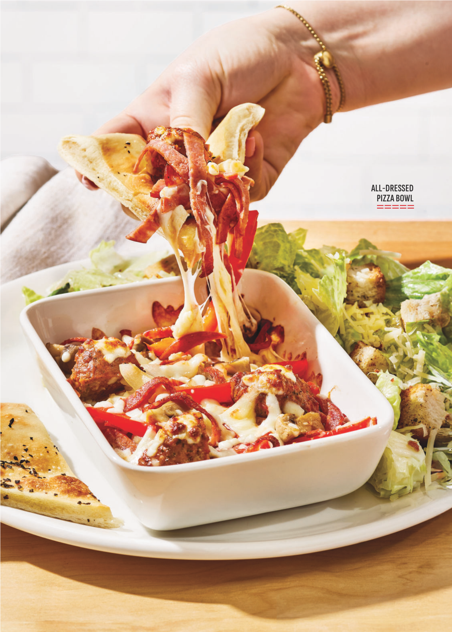
ALL-DRESSED PIZZA BOWL